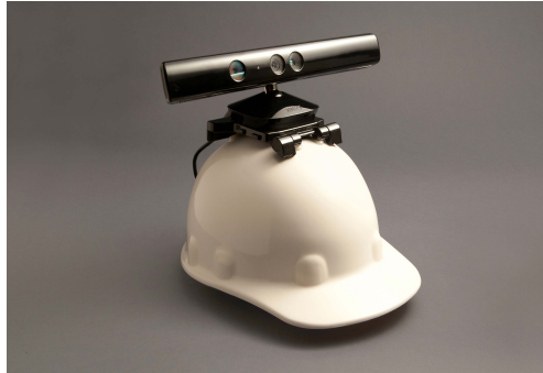
Wearable 3D mapping system prototype

PARC is developing a portable thermal mapping system that generates detailed measurements registered on a 3D map of a building or structure, making its use ideal for energy efficiency audits.